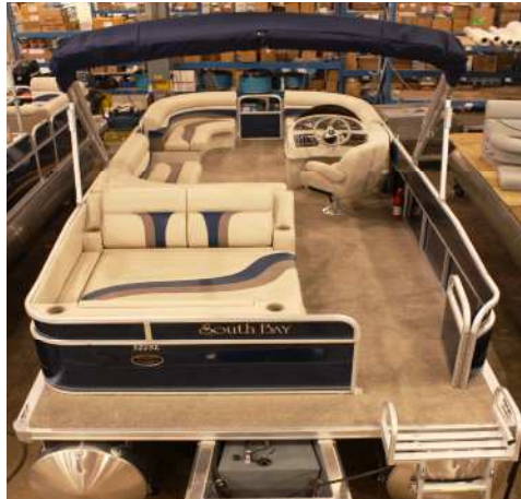
South Bay 522SL

SEE THE NEW SOUTH BAY 522SL. This is a brand new model for South Bay, in a sun lounge style. The boat has 25" pontoons, and 16" on center cross members for total boat stability. Both pontoons have a full length keel for protection and turning along with 52" nose cones for improved water penetration. The boat comes standard with a Jensen AM/FM MP3, iPod ready stereo and full instrumentation. All the cleats are stainless steel, the boat has a full mooring cover and an 8' bimini top with adjustable bow arms. The boat with a 40hp Mercury Four Stroke Big Foot motor and full coast guard package starts at under $20,000. See its sister ship the 724 SL pictured here too!!